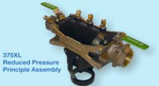
375XL Reduced Pressure Principle Assembly