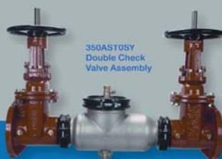
350ASTOSY Double Check Valve Assembly