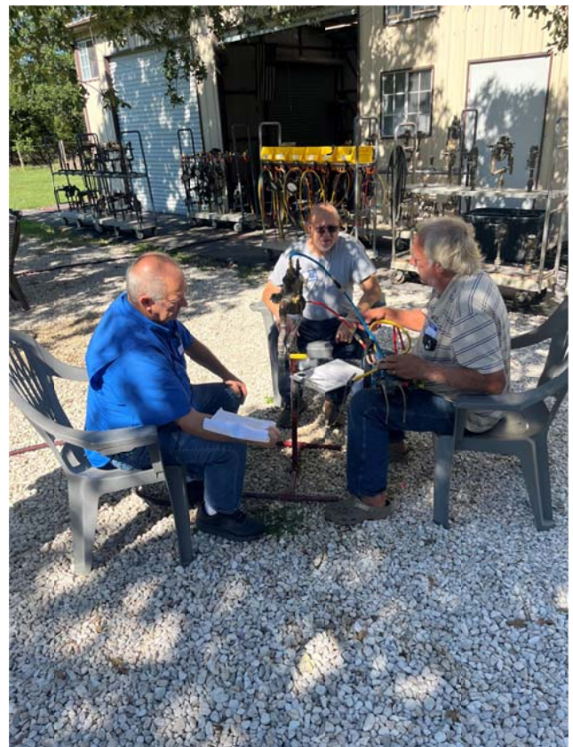
2024 Hands-On Training at Bac-Flo Unlimited