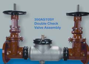
350ASTOSY Double Check Valve Assembly