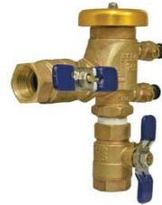
FEBCO Series 765 Pressure Vacuum Breaker