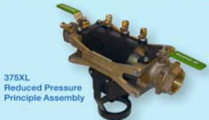
375XL Reduced Pressure Principle Assembly