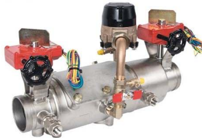
Ames Deringer™ 30