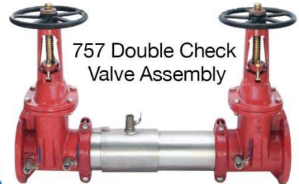
757 Double Check Valve Assembly