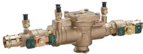
LF009 Reduced Pressure Zone Assembly